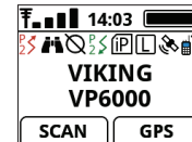
Day - High Contrast